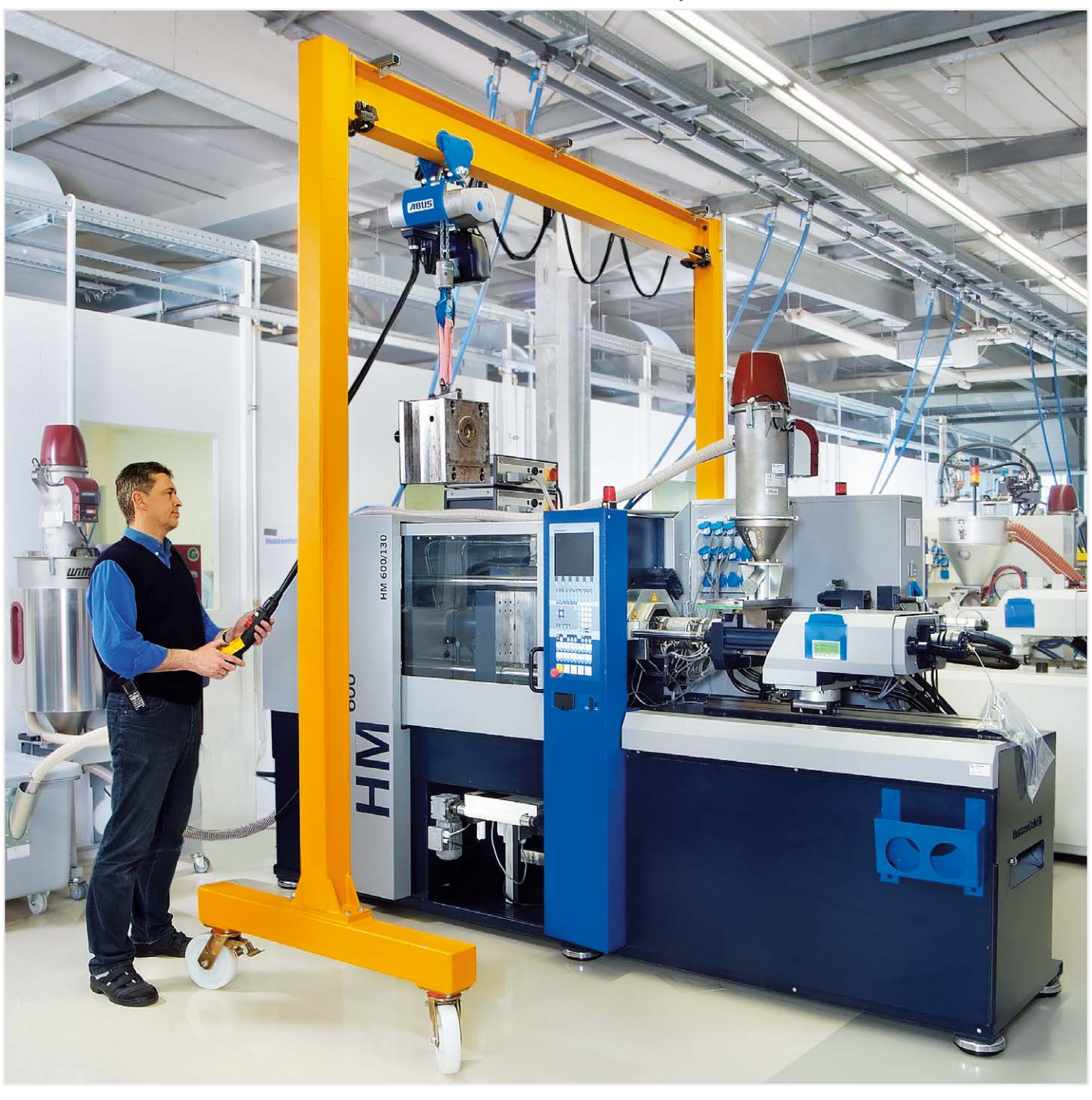
short delivery time

ABUS Kransysteme GmbH - P. O. 10 01 62 - 51601 Gummersbach - Germany - Phone +49 2261 37-7200 - e-mail: info@abuscranes.com